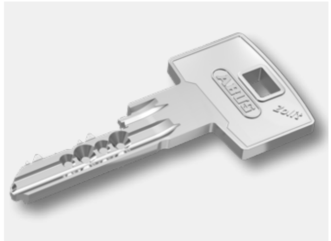
The high-quality, stable key is made from low-wear nickel silver to ensure long-term security.