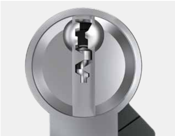
The Zolit conventional locking system with vertical key insertion opens the door conveniently.